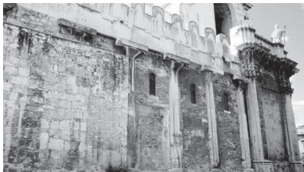
The cathedral in Syrakus (4th century). The old Greek temple was simply surrounded by a stone wall. Its ancient pillars can still be seen today.

It is true that during the Christian evangelisation it was not rare for Christian churches to be built on locations of pagan sanctuaries or cult places. Sometimes the old sanctuaries were simply built upon.