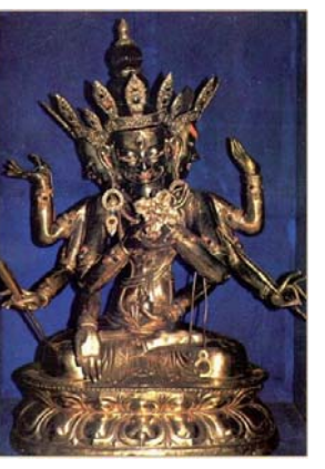
The goddess Cannon is revered as one of the Reiki godesses.